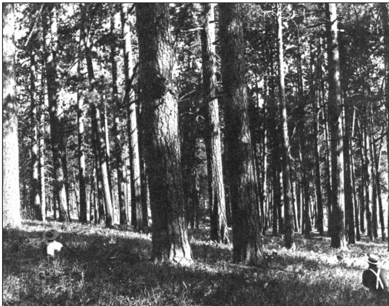
Historic Lick Creek forest conditions, shown in 1909, immediately before partial cutting.

Omitted is an available 1909 photo of the “heavily stocked” Lick Creek forest “immediately before partial cutting,” as shown immediately below (USFS 1995 and 1999):