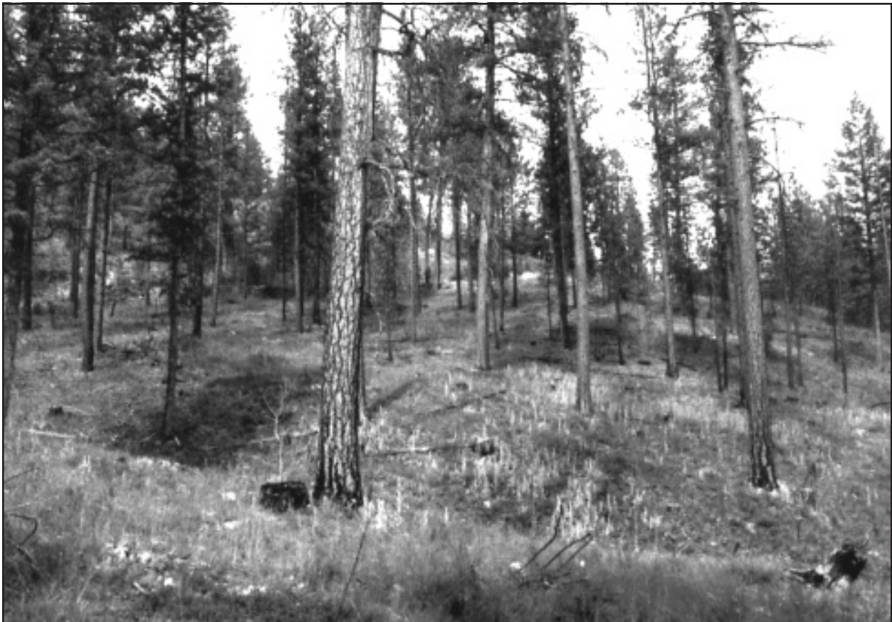
The results of recent Lick Creek "ecosystem management treatments" intended to return the forest to fictitious historic conditions.

It's updated poster "88 Years of Change in Ponderosa Pine Forest" (shown on the title page of this report) furthers the deception by adding a 1997 photo of the results of "ecosystem management treatments," as shown in the photo immediately below (USFS 1999), which compares nicely to the widely-spaced ponderosa pine trees shown in the post-logging 1909 photo: