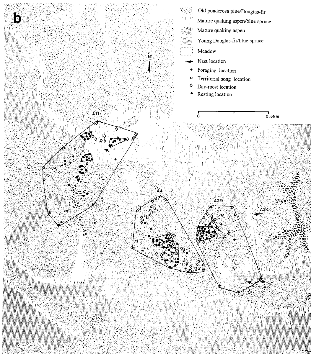
FIG. 1. Continued.

We examined the owls' choices of habitat at the second-order of selection (establishment of home range) by comparing the proportional area of overstory types within home range boundaries to the proportional area of types available within the study area. For this comparison, we established 95% confidence intervals on the mean proportions of each overstory type within the seven home ranges. Our investigation of the owls' third-order habitat selection focused on habitats used for foraging. We determined choice of overstory